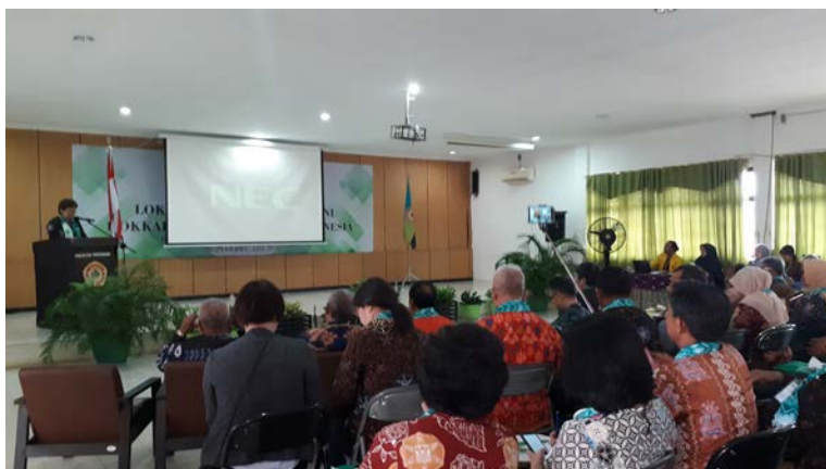
Figure 4. Indonesia Alumni of Hokkaido University Workshop and Meeting