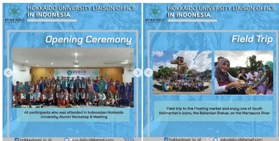
Figure 3. Indonesia Alumni of Hokkaido University Workshop and Meeting